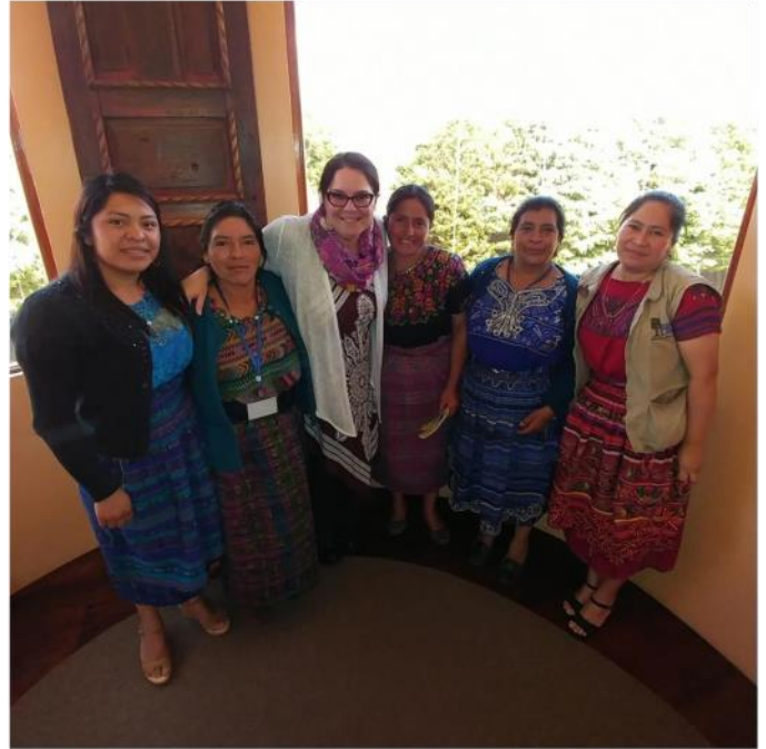
Above: mutual collaboration and appreciation at a training event on the trip.

Details about the trip on the Horizons of Friendship blog: https://www.horizons.ca/blog/2018/2/24/strength-and-resilience-in-toniticapn