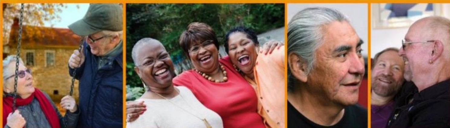
These are stock photos with models

Contact: Chris Jardin [705-749-9110 ext 206]